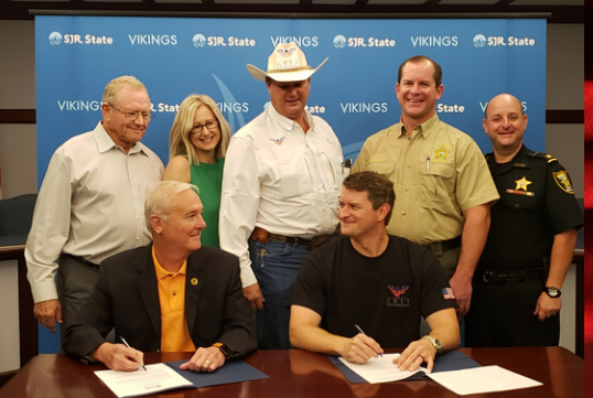
TEAM GRIT SIGNS AGREEMENT LAUNCHING PUTNAM COUNTY SHERIFF'S SCHOLARSHIP PROGRAM

CEAM GRIT DELIVERS TRAUMA KITS TO <u>GILCHRIST</u> SHERIFF'S OFFICE